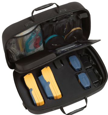
DTX Compact OTDR Kit