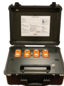
Bump/Cal Test Station