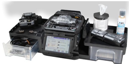
In Work Tray

The Fujikura 90R is the mass fusion splicer workhorse of the splicing world. As data demand continues to rise, the solution to handle the increased traffic is to increase fiber counts. As a result, fiber counts being utilized in enterprise data centers, campus, and metro networks have grown enough to make single fiber splicing too costly and timely. High density cabling made possible by SpiderWeb Ribbon® (SWR®) and others like it are spurring ribbon splicing activity in places that have traditionally used loose fiber. The 90R is the answer to these changes in splicing demand. With automated splice start, tube heater, wind protector, cleave tracking, and blade rotations for up to 2 cleavers at a time, this splicer frees up operator time for other fiber preparation steps. New to the 90R, you can keep your splicer in the field longer with field replaceable V-grooves. When V-grooves can no longer be cleaned after extended use, or are accidentally damaged, you can resume splicing in minutes by installing the spare set included with your 90R kit. Put our 90R to the test by contacting us to see its capabilities first-hand, 1-800-235-3423.