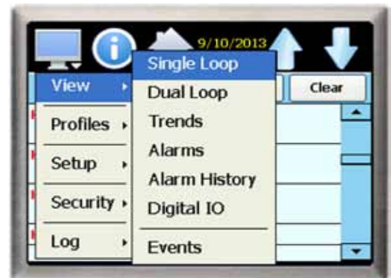
Windows - Based Navigation