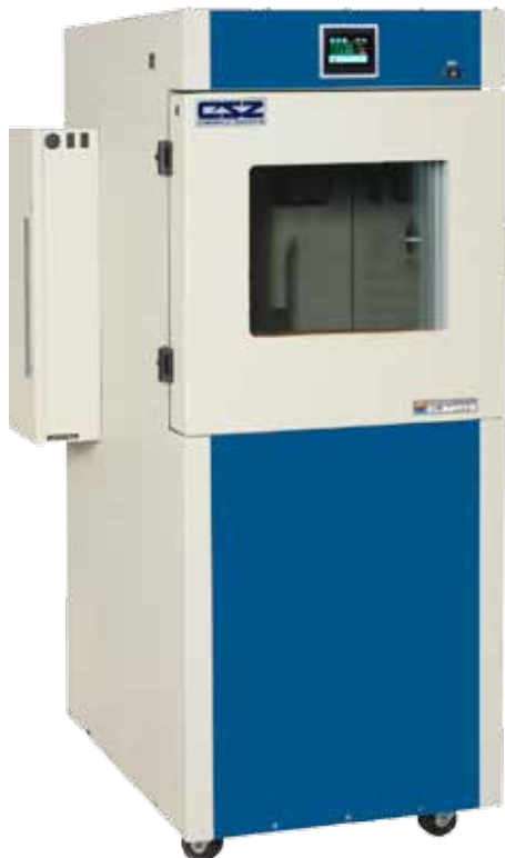
MC-3 shown with optional window and humidity

Optional equipment is economically priced to enhance performance and customize your chamber to meet your needs. A complete selection of optional accessories are available.