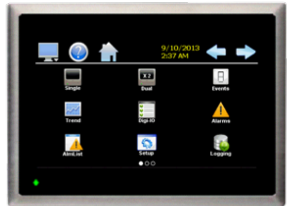
Icon - Based Navigation