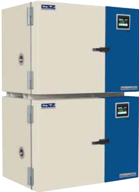
MicroClimate Benchtop Temperature Chamber shown in the stacked position.

These chambers are designed to provide users with a compact chamber for testing small components and products for a variety of industries. Whether you need to perform temperature cycling tests or expose your product to steady state temperature environments, these chambers will maintain precise and accurate temperature/humidity control throughout your test. Choose from benchtop and reach in models to fit your laboratory testing needs.