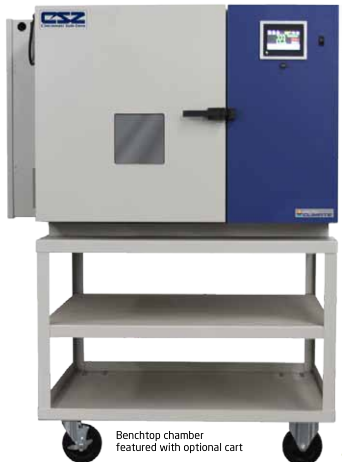
Benchtop chamber featured with optional cart