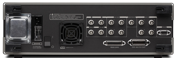
SR810/830 rear panel