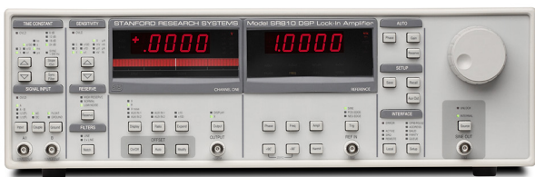
SR810 DSP Single Phase Lock-In Amplifier