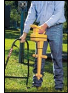
3M™ Dynatel™ Cable/Pipe and Fault Locator 2273M

The receiver also accommodates four user-definable auxiliary frequencies and allows the user to perform a self-calibration operation at any frequency at any time. With the easy-to-use configuration tool, users can enable or disable any of 22 frequencies.