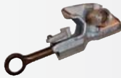
Hot Line clamp Hotstick compatible