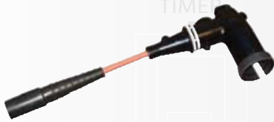
Fitted with 12" of cable and female MC connector