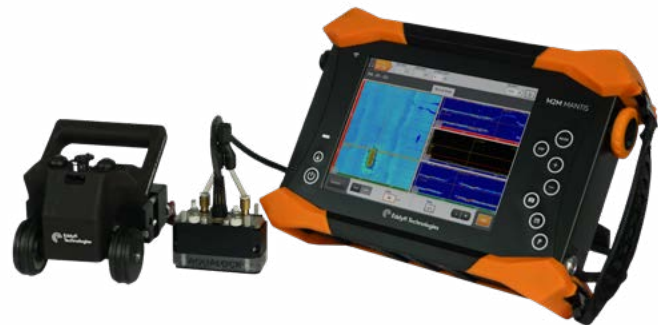
Play/Pause/Increment buttons to use with Eddyfi scanners