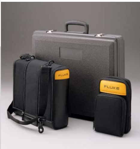
Fluke C789, C700, C781