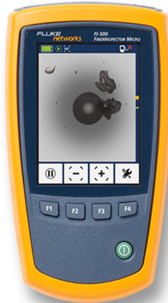
FI-500 displaying a dirty fiber endface