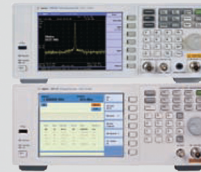
N9320A RF Spectrum Analyzer