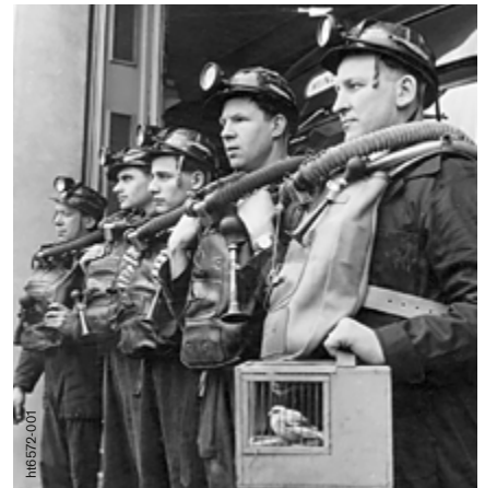
Mining is the historical origin of mobile gas detection. Canary Birds were used to alarm miners on harmful oxygen deficiency.

Dräger gas detectors are a family of its own. Own them or rent them – most important is, that you use them in daily work-life, for the safety of your staff. Get now familiar with our portfolio.