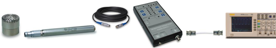
Externally Polarized Microphone System