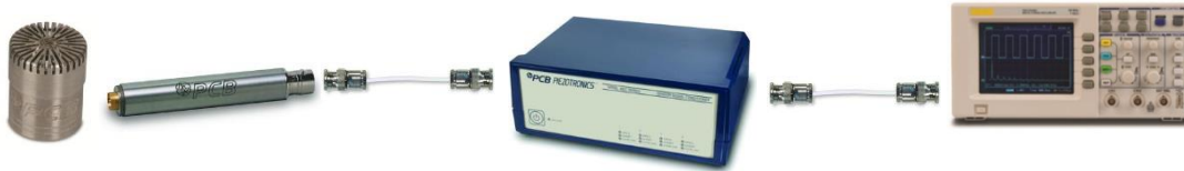
Prepolarized Microphone System