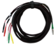
1009-322 Set of primary test leads (1 each)

Used to carry power cord, Ethernet cable, and test leads