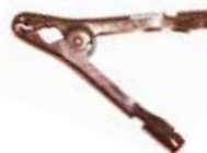
Large test clip (1 each)