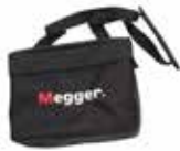
90001-165 Accessory Carry Case (1 each)

Accessories included in standard set of test leads.