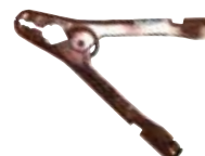
640267 Large test clip (1 each)