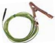
2003-724 Ground lead (1 each)

green with yellow, with large ground clip, 20 ft