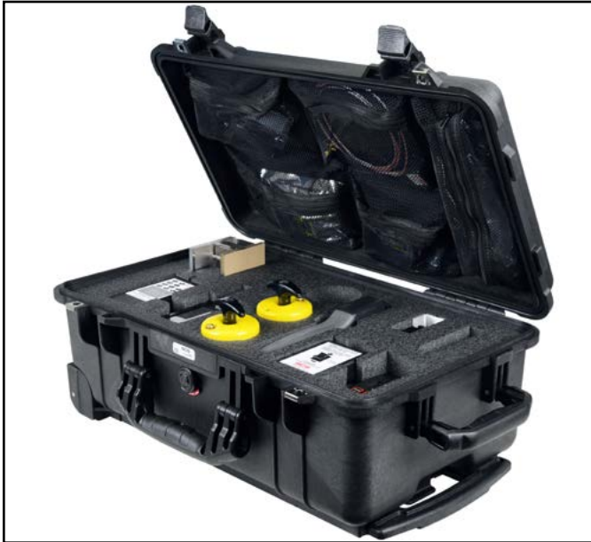
Figure 1. SCS 770045 EOS/ESD Assessment Kit