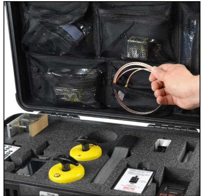
Figure 2. Using the EOS/ESD Assessment Kit's lid organizer

https://www.esda.org/standards/esda-documents/