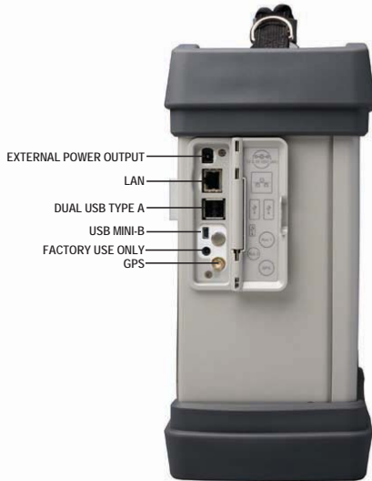
CONNECTOR PANEL ON LEFT SIDE OF MW82119A