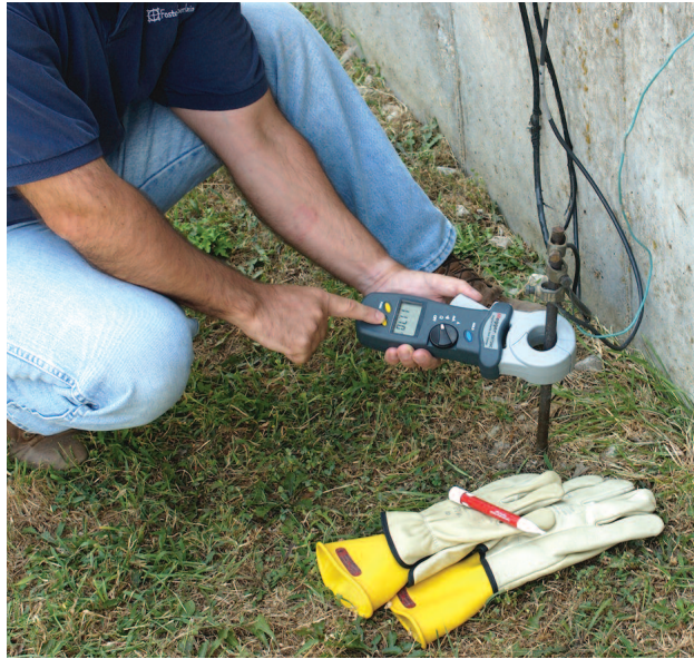
The DET20C instrument is shown being used to test a facility ground.