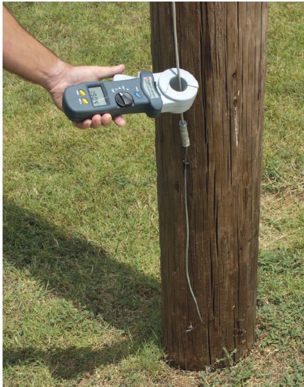
The DET20C instrument is shown being used to test a pole ground.