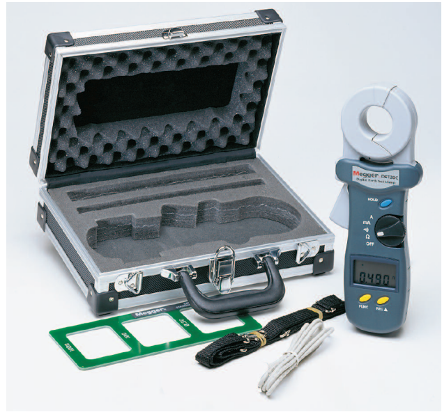
DET10C and 20C comes with a rugged carry case, calibration fixture, carry case shoulder strap and USB interface cable (DET20C only).