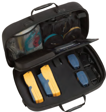
DTX Compact OTDR Kit