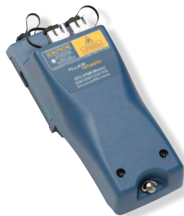
DTX Compact OTDR module