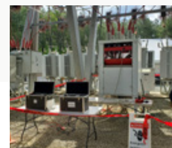
Switchgear and Circuit Breakers