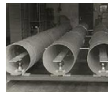
Iso Phase Buss