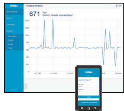
Wireless Configuration Interface Example (Desktop and Mobile Views)

The surface of the Indigo 200 enclosure is smooth, which makes it easy to clean. It is also resistant to dust and most chemicals, such as H 2 O 2 and alcohol-based cleaning agents.