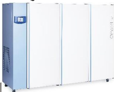
1212 (43 ft3)