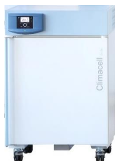
111 (4 ft3) Optional bench top casters available

The CLIMACELL was developed to create exact reproducible simulation of a wide range of environmental conditions for the testing of pharmaceutical and cosmetic products including medical devices. This includes ICH Q1A stability & secure data storage Warmcomm SW conforming to FDA 21 CFR part 11 .