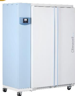
707 (25 ft3)

ICH Stability, Photostability & durability testing