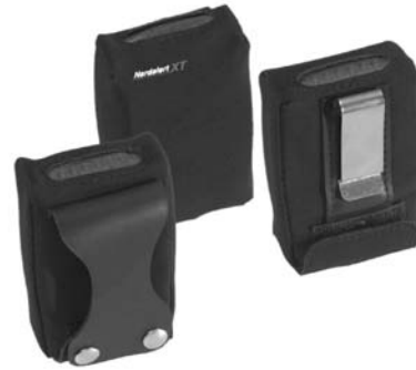
Soft cases are recommended for use by climbers and in severe weather: (l. to rt.) climber-harness case; case front; belt-clip case

The 8861 Series is designed for applications where the user will be in close proximity to strong ELF fields, such as from 50/60 Hz power lines. These monitors are very similar to the standard, full-featured series except that the inside of the housing has a special conductive coating that blocks the ELF signals. The low frequency range of these monitors is reduced by the coating.