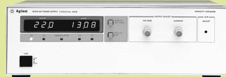
6010A, 6011A, 6012B, 6015A