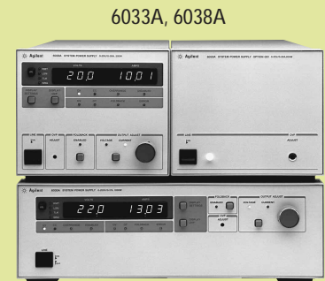
6030A, 6031A, 6032A, 6035A

Save rack space by using fewer outputs Reduce cost by using fewer power supplies