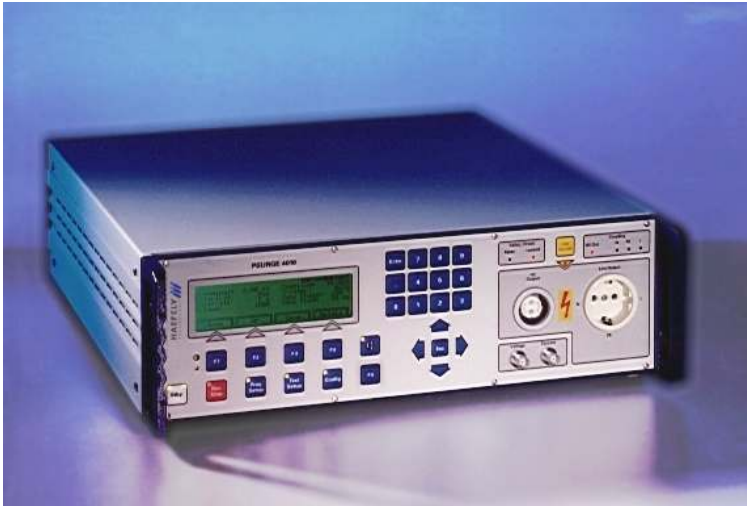
PSURGE 4010 - the compact IEC combination wave generator

Surge voltage transients are caused by switching and lightning effects. The PSURGE 4010 allows evaluation of the performance of equipment when subject to high-energy disturbances on power and interconnection lines.