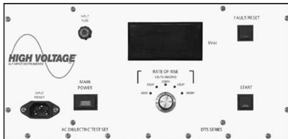
DTS-60D Front Panel

NOTE: For 230 Volt line input models, an F is suffixed to the model number.