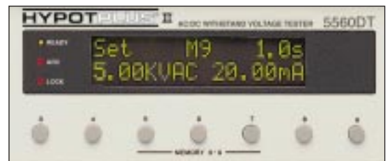
High resolution LCD clearly indicates setup parameters and test results. Single function dedicated keys speed setup without scrolling through the menu.