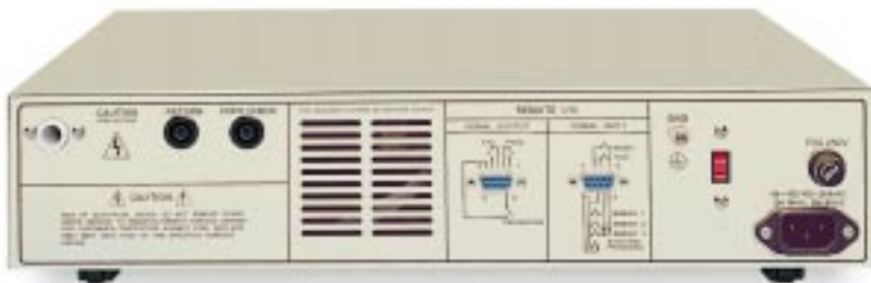
HypotPLUS® II includes rear panel high voltage and return connections and remote control connections to make it easier to build into a rack mount system.