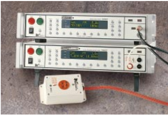
HypotPLUS® II shown with HYAMP® II and interconnecting receptacle box for testing products terminated in a line cord. Also shown are the standard rack mount handles.