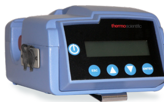
Thermo Scientific™ Personal DataRAM pDR-1500 Monitor

delivered through volumetric flow control and ACGIH traceable cyclones, available in pairs, for PM10 and PM4 or PM2.5 and PM1. A toroidal entrance assures optimized aerosol aspiration and a representative sample even without a cyclone.