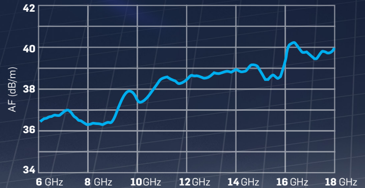
DR-01 - Antenna Factor