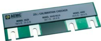
25Ω Calibration Checker Catalog #2118.58

Test Kit for Model 3620 includes 16 ft lead, two 150 ft leads on spools, two wind-up handles, two auxiliary ground electrodes and molded hard carrying case with slot for meter Catalog #2114.96