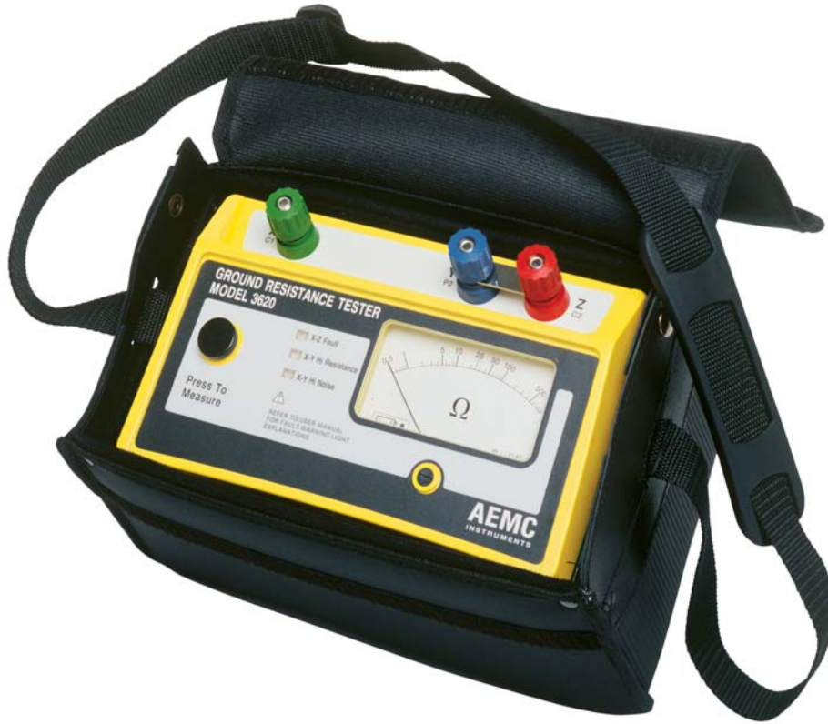
Model 3620 shown in standard soft carrying case Catalog #2114.90