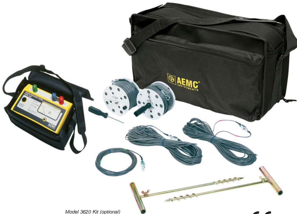
Model 3620 Kit (optional) Catalog #2114.91