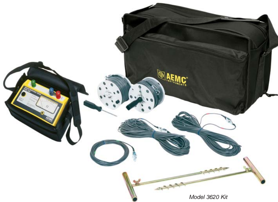
Model 3620 Kit Catalog #2114.91