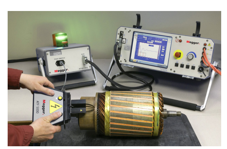
Testing an armature using the ZTX accessory and the ATF5000 commutator probe.