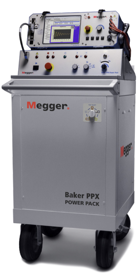
The AWA-IV combined with a PPX Power Pack

Bar-to-bar armature tests on low-impedance coils are possible with the use of the Baker ZTX bar-to-bar test accessory or Baker PP85 or PPX 30A power packs. The Baker ZTX accessory reduces the voltage applied while increasing current to enable accurate tests on DC motor armatures as well as other low-impedance windings. The ATF 5000, a hand-held device that comes with the Baker ZTX , improves the speed, accuracy and ease of testing armatures bar-to-bar.