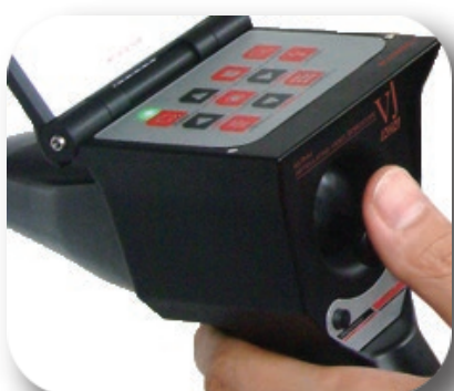
Joystick articulation control