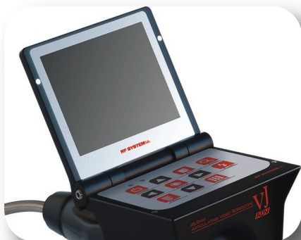
Stand-Alone Imaging Unit